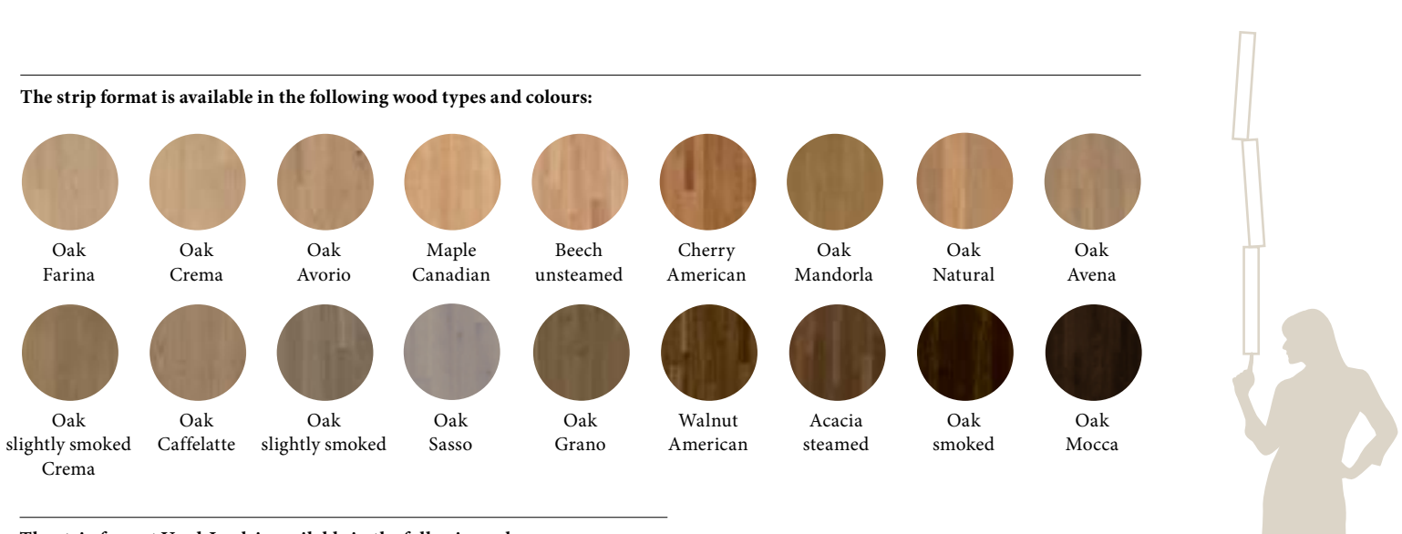
The strip format Used-Look is available in the following colours:

Solopark comes in a classic short-strip format with oak products in various colours. The Solopark-assortment has its focus on project business and offers a compact but attractive colour-range on three surfaces: matt lacquer, natural oil and B-Protect<sup>®</sup>. The top layer is made from European oak.